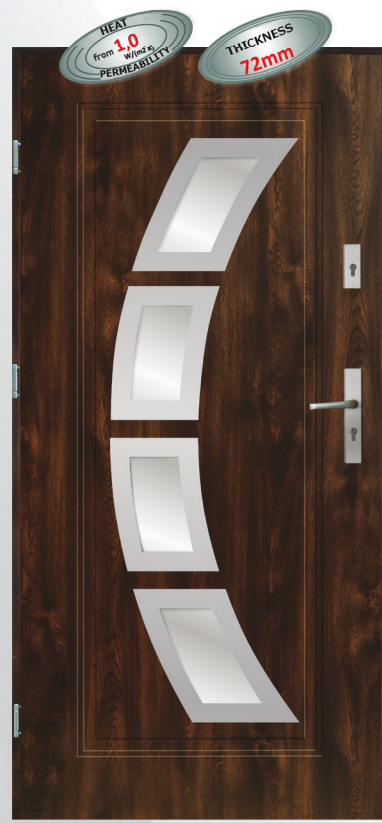
72 Modern Silver 92-05 Reflex door leaf, laminated door-frame