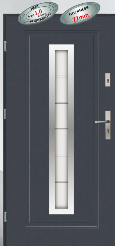
72 Modern Silver 92-19 door leaf, laminated door-frame