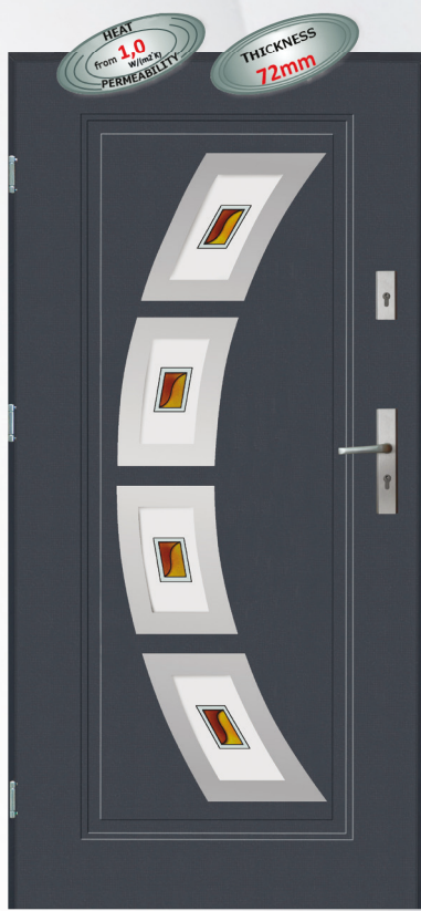
72 Modern Silver 92-04 door leaf, laminated door-frame