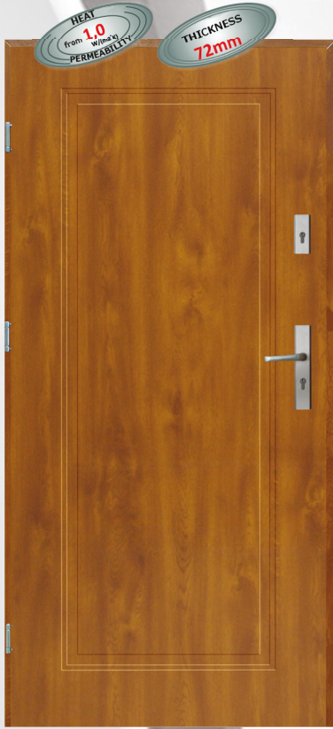
72 Modern door leaf, laminated door-frame