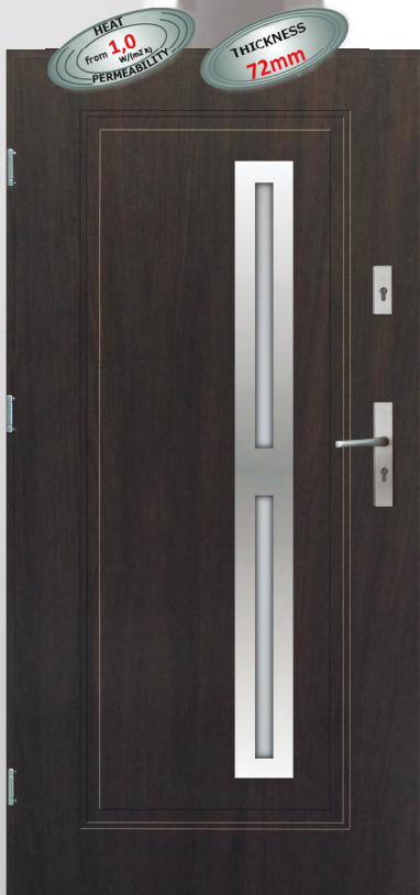
72 Modern Silver 92-17 Reflex door leaf, laminated door-frame