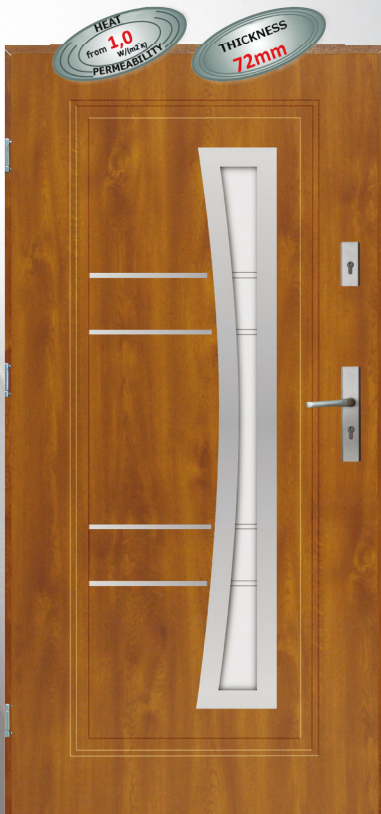
72 Modern Silver 92-18 door leaf, laminated door-frame